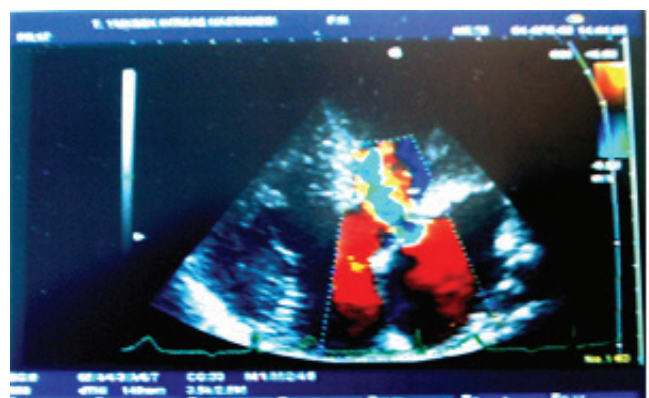
Figure 2. Echocardiographic findings

Ivemark syndrome accounts for 1-3 % of all congenital heart defects. The most frequent cardiac mal-