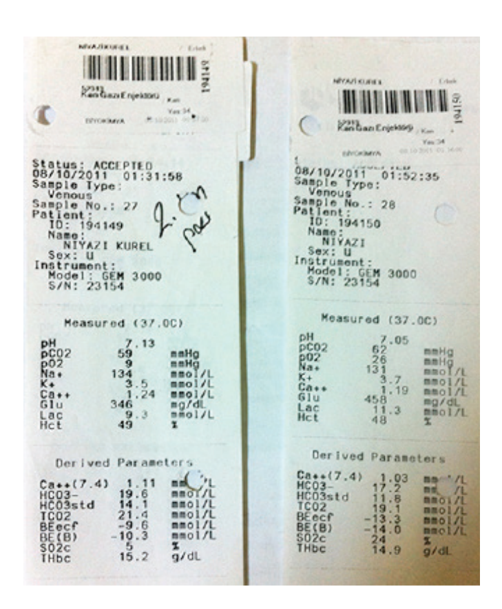
Figure 1. Initial blood gases results.

When he was stable, pulmonary CT angiography