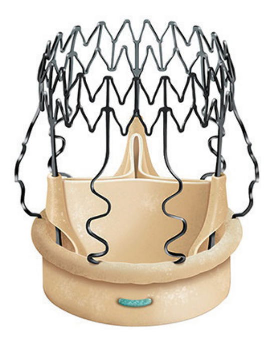
Figure 1. The innovative sutureless Perceval bioprosthesis (Sorin Group S.p.A., Saluggia, Italy).

In the SU-AVRs population, a partial upper sternotomy (J-sternotomy) in the third intercostal space or in the fourth intercostal space or a full median sternotomy was performed to obtain access to the aorta, according to the surgeon's preference. After systemic hepariniza-