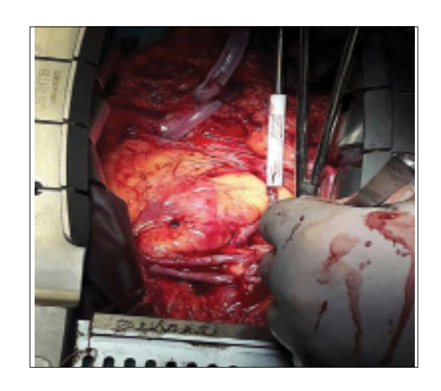
Picture 1. IAAD was identified after removing the side clamp from the aorta in both patients, the intimal tear was located on the site of proximal anastomosis.

At the same time, avoiding greater curvature of the aorta, the classic dissection site, for placing proximal anastomosis and preferring the inner part of the aorta, can reduce the risk of complications. In the presence of