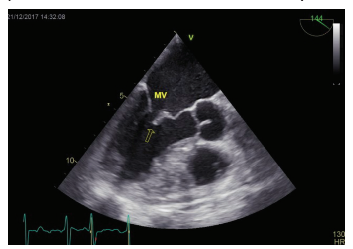
Figure 1. Rheumatic mitral valve and moderate mitral stenosis (transesophageal echocardiography)

Physical examination revealed a systolic murmur of 3/6° in the mesocardiac area and a diastolic murmur of 3/6° in the apical area. Twelve-lead-electrocardiography showed atrial fibrillation. Transthoracic echocardiography found that the left ventricular ejection fraction was preserved, and revealed calcified and thickened mitral valve, mild mitral regurgitation, moderate tricuspid regurgitation with a pulmonary systolic pressure of 40 mmHg and suspicious view at interatrial septum. Mitral valve area was 1.2 cm<sup>2</sup> according to the pressure half-time method. To minimize the risk of miscalculations due to decreased left atrial pressure we also calculated as 1.3 \text{ cm}^2 with the planimetry method. The mean diastolic transvalvular mitral valve gradient was 7 mmHg. There was no information about ASD in previous echocardiography reports. Transesophageal echocardiography (TEE) was performed to the patient because of the suspicious view at interatrial septum. TEE revealed rheumatic mitral valve and moderate MD (Figure 1). A small ASD was observed in the 2D TEE and contrast echocardiography (Figures 2 and 3). ASD defect measured 6 mm. Having a history of PMBV no information about ASD in previous report and this new evidence was diagnosed with acquired LS. This is thought to have arisen iatrogenically due to PMBV in 2014 and/or spontaneously due to extreme tension of the left atrium. We took the patient to medical treatment and intensive follow-up.