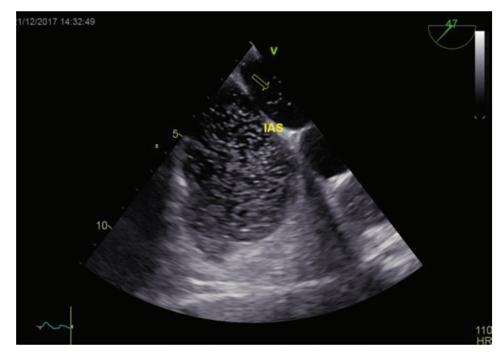
Figure 3. A small atrial septal defect with contrast echocardiography (transesophageal echocardiography)