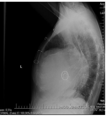
Figure 1. A. Preoperative coronary angiogram view showing Bjork-Shiley tilting disk valve in mitral position, B. Preoperative lateral chest X-ray view showing Bjork-Shiley tilting disk valve in mitral position

a well-seated, normally functioning prosthetic mitral valve with a mean pressure gradient of 5 mmHg. The left atrium was enlarged (8 cm) and the left ventricle remained normal in size. Left ventricular systolic function was normal with an estimated ejection fraction of 65%. The size of the right atrium was 12x10 cm, the diameter of the inferior vena cava was 4.1 cm. She had a severe tricuspid valve (TV) regurgitation and moderate pulmonary hypertension (systolic pulmonary artery pressure=50 mmHg). Tricuspid regurgitant velocity (TRV) was 3.3 m/s and tricuspid annular plane systolic excursion (TAPSE) was 13mm. We planned to perform only TV repair and not to touch the functioning BS valve.