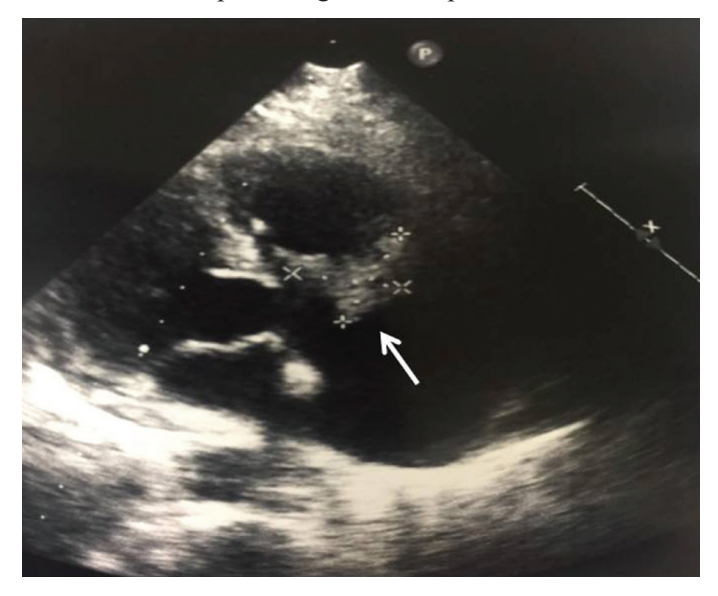
Figure 2. Transthoracic echocardiography demonstrates the right heart thrombus and vegetations in a male patient who underwent atrial septal defect closure previously (white arrow)

Statistical analyses were performed with SPSS software version 19.0. Continuous data were summarized as mean \pm standard deviation or median with interquartile range (25<sup>th</sup>-75<sup>th</sup> percentiles), and categorical data were summarized as percentages or frequencies. Differences