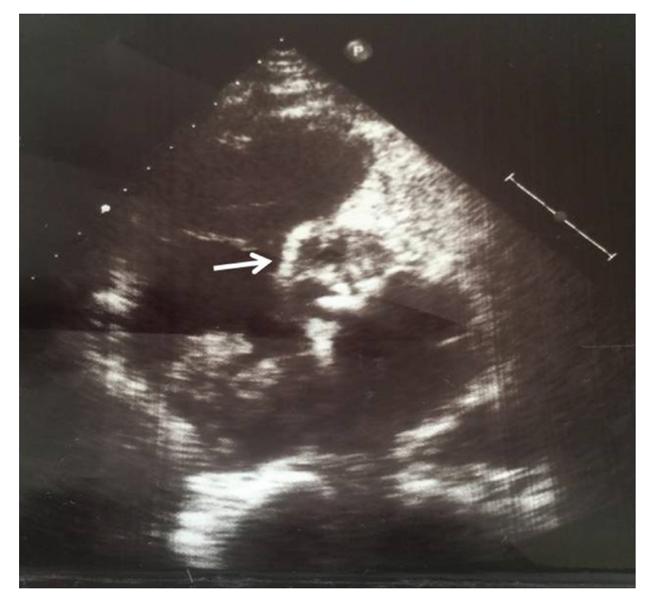
Figure 1. Transthoracic echocardiography shows the large vegetation in a female patient (white arrow)

Of the patients with severely degenerative tricuspid valve and adjacent tissue due to endocarditis, we excised the tricuspid valve only in three patients. We replaced an artificial biologic heart valve. In appropriate patients,