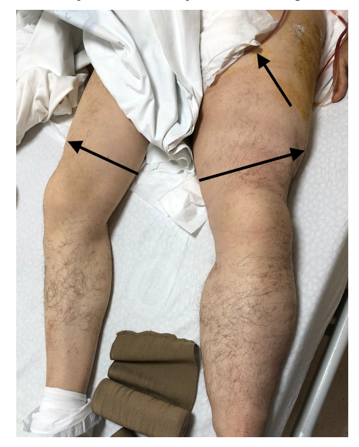
Figure 3. Comparison of both left and right legs after surgery with a surgical drain tube

As vascular surgeons, damage control and bleeding are important aspects of our lives. In some situations, elective operations also require vascular surgeons in