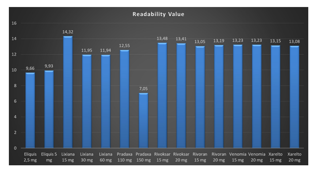
Figure 1. Readability values of patient information leaflets according to various criteria